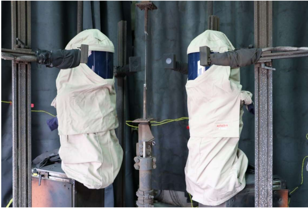
Figure 6-1: Photograph of a specimen as tested before the arc exposure.

Selected photographs of the samples are shown in Figures 6-1 and 6-2.