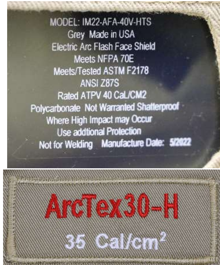
Figure 3-1: Photograph of tested product and label