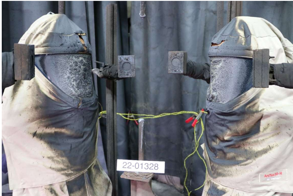
Figure 6-2: Photograph of a specimen after the arc exposure.

Note: arc exposure incident energy level near the Arc Rating of the material.