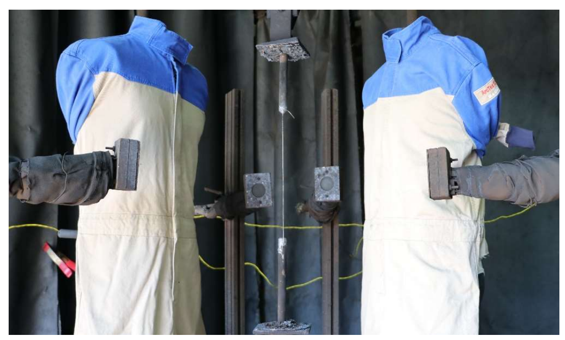
Figure 6.1: Garments as tested before arc exposure.

Photographs for the garments before and after the arc exposure are shown in Figure 6.1 - 6.3.