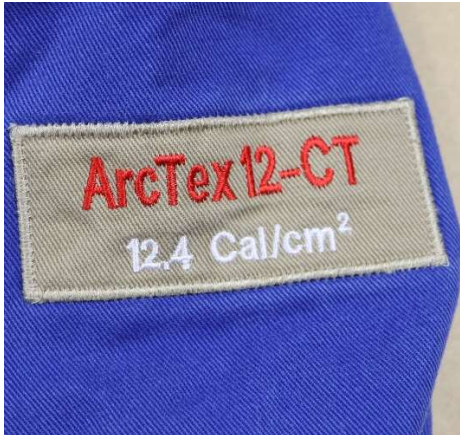
Figure 3.1: Photograph of the specimen.