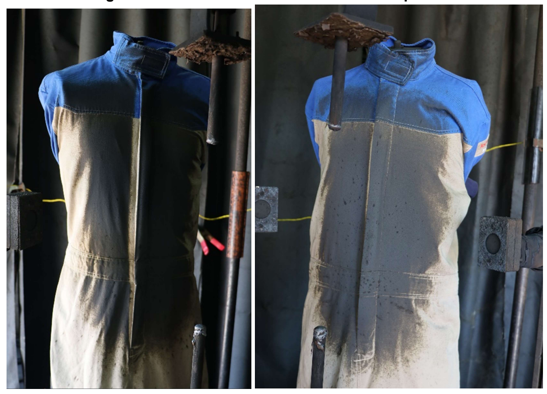
Figure 6.2: Garments after arc exposure. (Test# 22-1724)